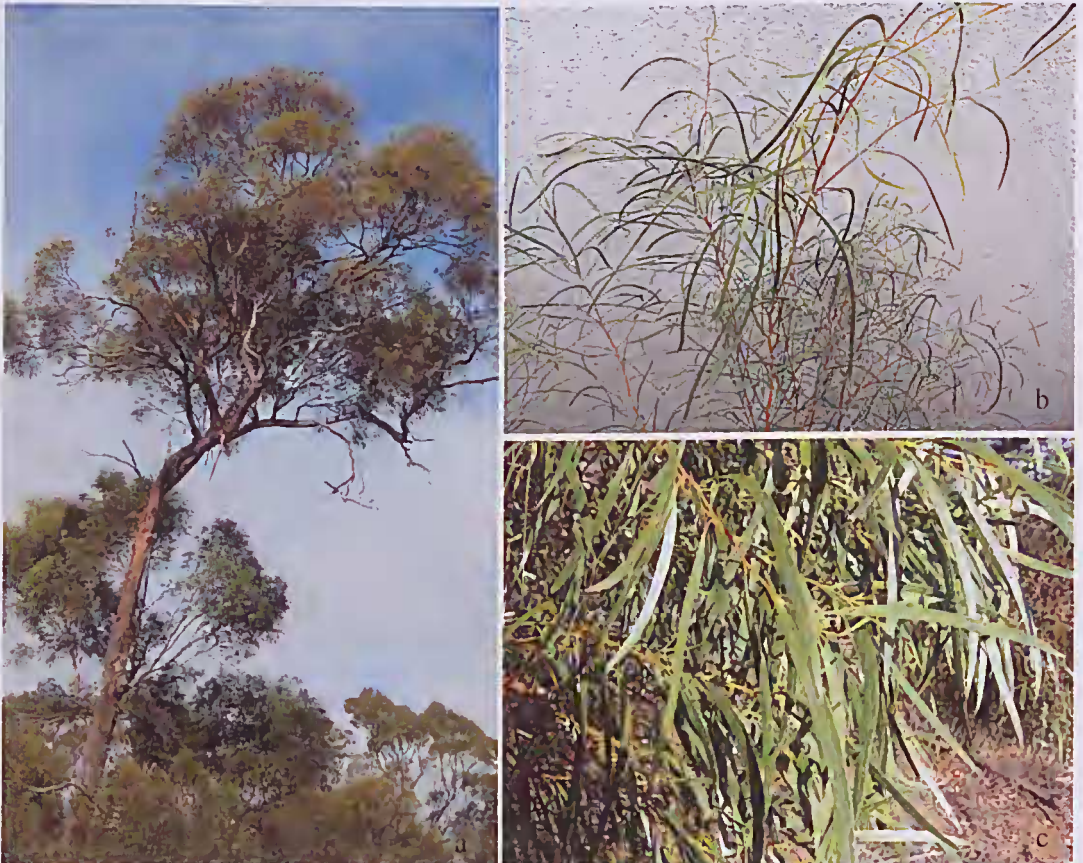
Figure 1: Eucalyptus viridis , SE of Wedderburn seed-lot. a. tree; b. juvenile leaves; c. foliage.

The results indicated that the seedlings across the provenances of typical E. wimmerensis exhibited little